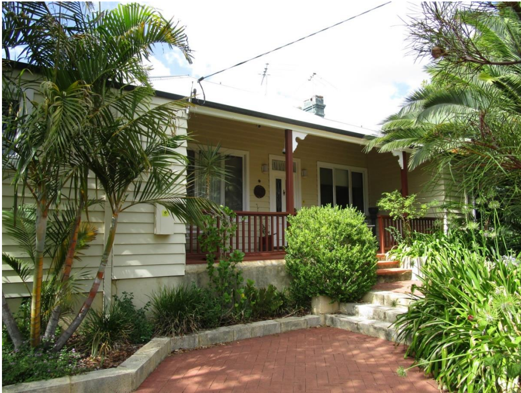
Rosendale 11 Owen Rd 2017

The Edmondson family have a number of dedications in St Cuthbert's Church to various family members.