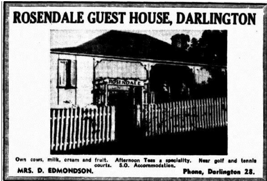
1936 Advertisement in the West Australian Newspaper