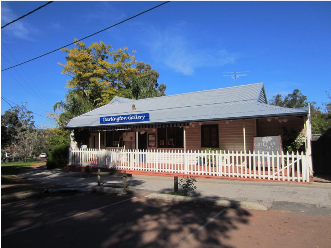
2014 Darlington Gallery

Another regular event was the annual shopping evening hosted by Darlington Gallery and the Darlington Post Office and including a street market, nibbles and refreshments.