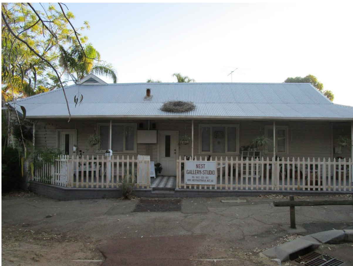
20 Brook Rd Darlington Nest Gallery and Studio 2020