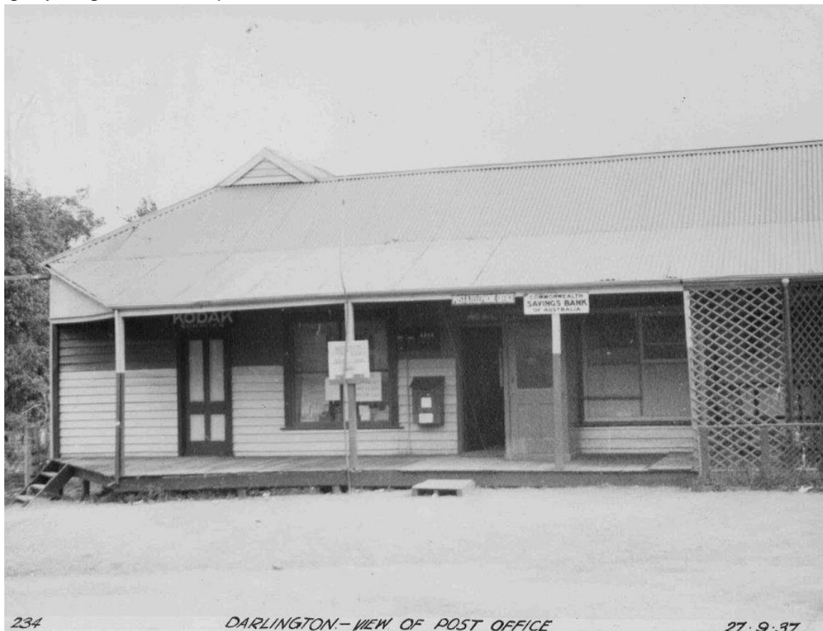
Postcard of the building owned by Leedman in 1937

the local Primary School during the war years, Oslo lunches, were served once a week at the tearooms. In 1950, the two business buildings and property were formally separated by the Leedmans. The Post Office became block number 20, was 723 sqm with the address 18 Brook Rd. The tearoom was block number 21 and slightly larger at 850 sqm with the address 20 Brook Rd.